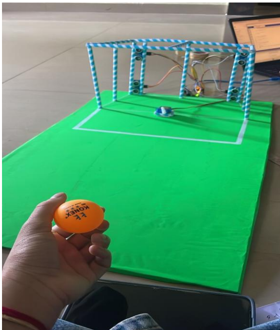
Figure 1.2: Automatic Goal Defending System

systems. The implementation phase focuses on transforming the conceptual design into a functional prototype through proper hardware and software integration. The Arduino Uno microcontroller is interfaced with two HC-SR04 ultrasonic sensors, which are strategically placed to provide a multi-directional field of detection. This hardware setup, combined with embedded C programming in the Arduino IDE, enables seamless communication between components, ensuring accurate sensing, processing, and actuation within the system.